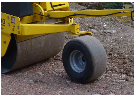
Comfortably to control Wheel set (optional)