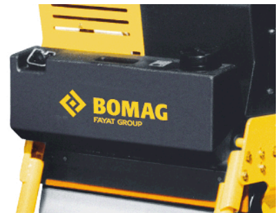
No sticking of asphalt Water spraying system with large water tank (standard)