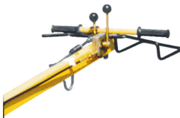
Precise and save to operate All function integrated in the steering rod head