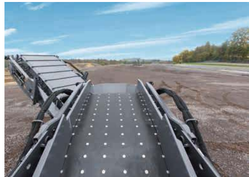
Flexible in use – the optionally available swivel wheel for the BMF 2500 S.