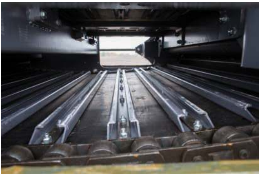
Work reliably – the chain-reinforced conveyor belt prevents downtime.