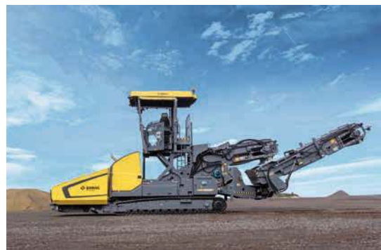
Everything in sight – the optional lift platform provides the best overview.