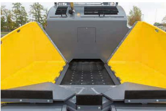
Counteract demixing – a width of 1.20 m ensures gentle material transport.