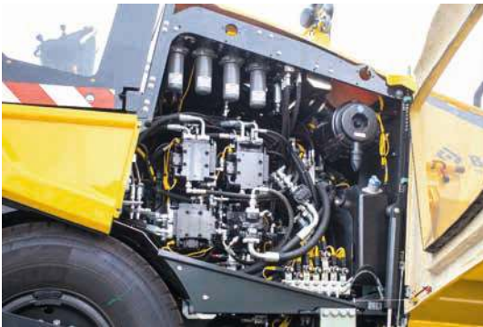
Save up to 17 % fuel – demand-driven hydraulics – with BOMAG ECOMODE.