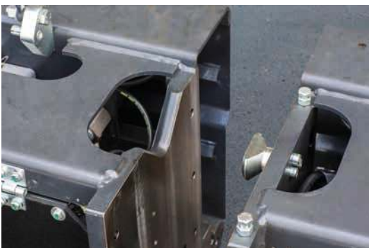
Attaching is up to 48 % quicker – thanks to the BOMAG QUICK COUPLING SYSTEM.