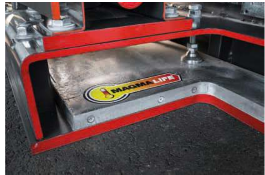
Heats up nearly 60 % quicker – unique MAGMALIFE heating system.