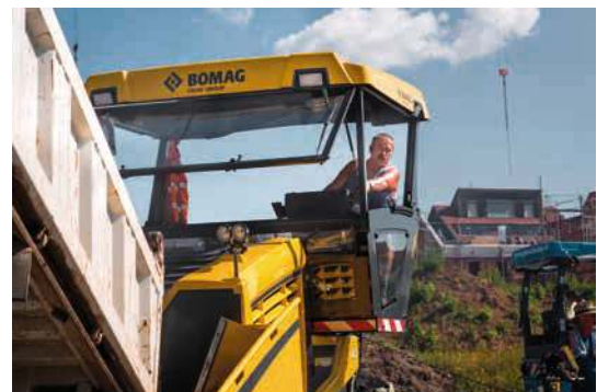
The right position in each situation – the comfortable driver's cabin.