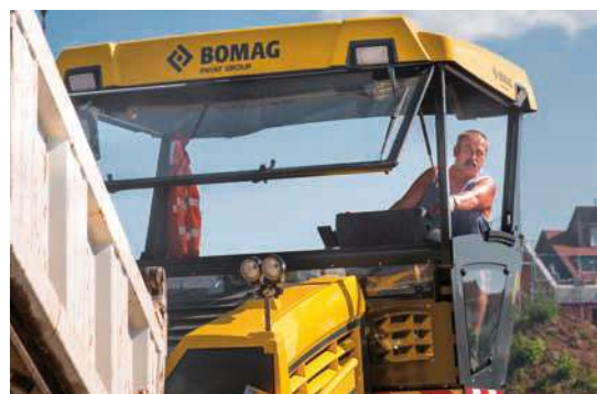
The right position in each situation – the comfortable driver's cabin.