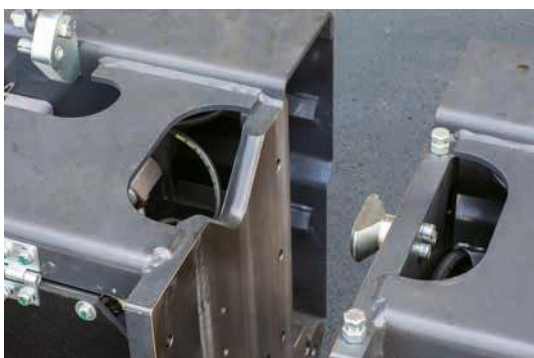
Attaching is up to 48 % quicker – thanks to the BOMAG QUICK COUPLING SYSTEM.