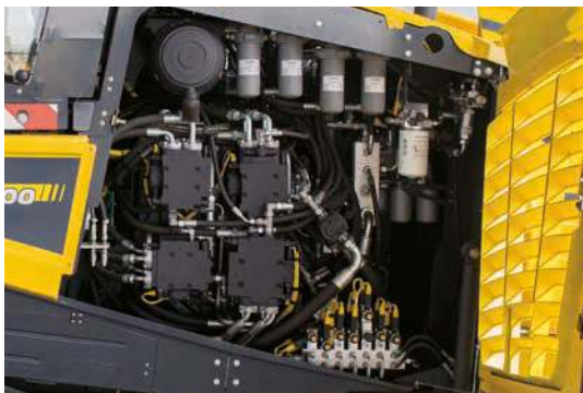
Save up to 17 % fuel – demand-driven hydraulics – with BOMAG ECOMODE.