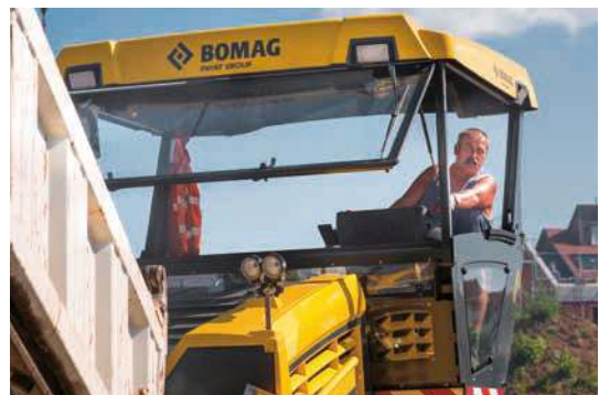
The right position in each situation – the comfortable driver's cabin.