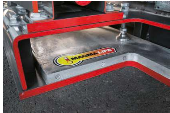
Heats up nearly 60 % quicker – unique MAGMALIFE heating system.