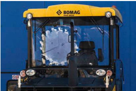
Optional weather protection – for maximum convenience.