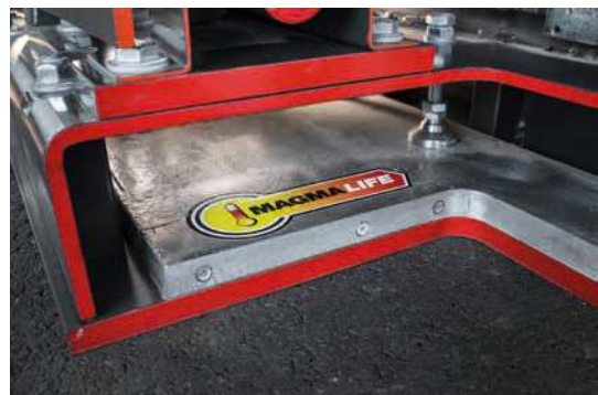
Heats up nearly 60 % quicker – unique MAGMALIFE heating system.