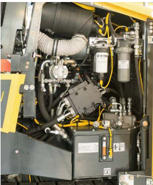
Save up to 17 % fuel – demand-driven hydraulics – with BOMAG ECOMODE.