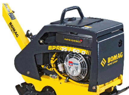
Robust and reliable Best component protection