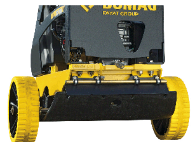
Simple and safe transport Transport wheels (optional)