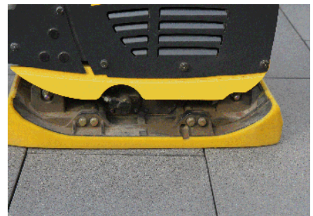
Large footprint for large formats