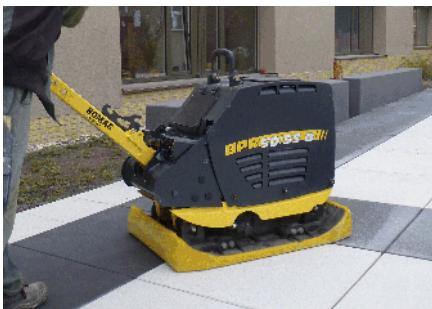
No breakage of paving stones