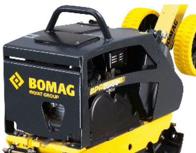
Robust and reliable Best component protection