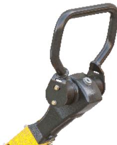
Precise and save to operate Comfortable control lever