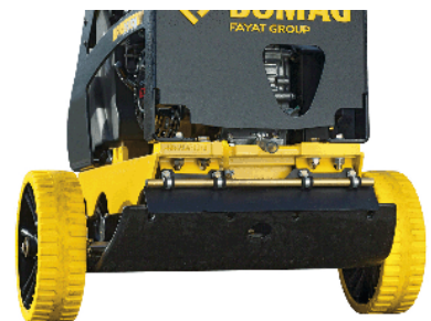
Simple and safe transport Transport wheels (optional)